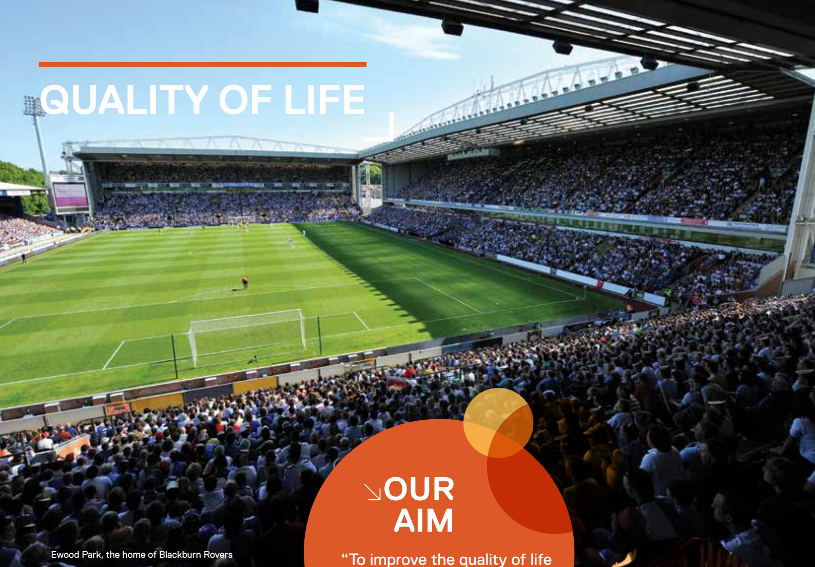
Ewood Park, the home of Blackburn Rovers