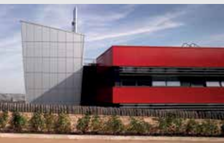
Blackburn Central High School