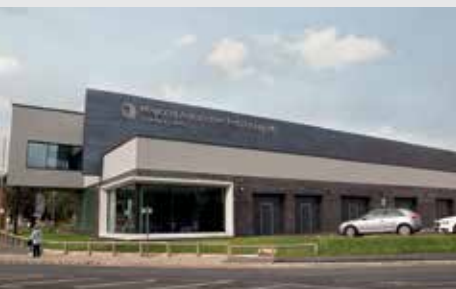
Regional Automotive Technology Hub at Blackburn College

“To improve the employment prospects of residents and ensure that business skills needs are met”