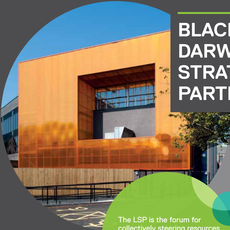
Blackburn Youth Zone – public/private partnership in action

The LSP is the forum for collectively steering resources and reviewing progress to ensure that we successfully deliver against our economic and social priorities.