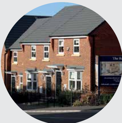
The Royals, Infirmary Road, Blackburn