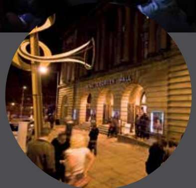
King George's Hall