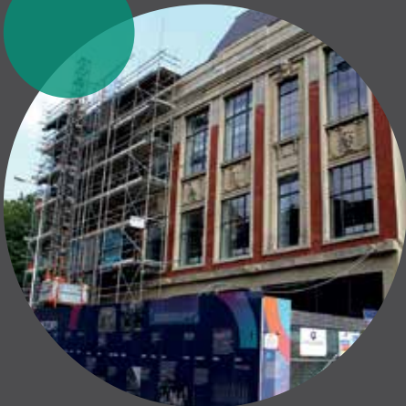
Renovating Blackburn Central Library

The overarching LSP Board represents the Borough's strong public, private and third sectors, and is made up of representatives from the area's partnerships shown below. ✓