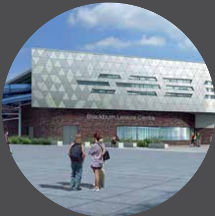
Blackburn's new multi million pound leisure centre development

“To improve the quality of life for all who live in Blackburn with Darwen”