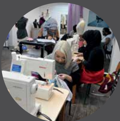
Entrepreneurial talent nurtured by local investment