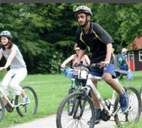
Cycle event at Witton Park