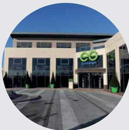
The multi-million pound Euro Garages Headquarters

BLACKBURN AND DARWEN BUSINESS LEADERS NETWORK