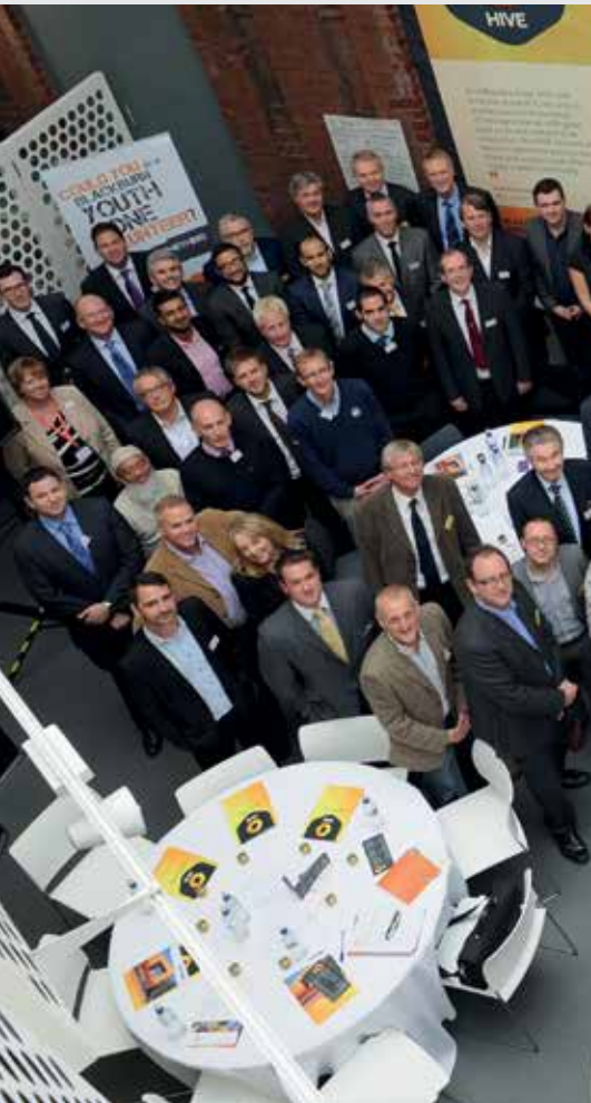
Launch of the Hive Network at Blackburn Youth Zone