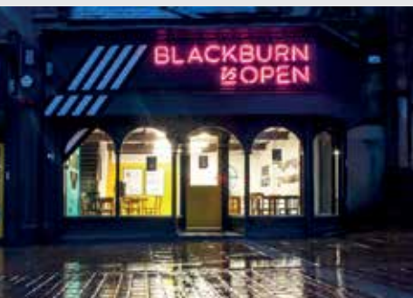
Blackburn is Open Pop-up Art Centre

“To improve the internal and external perception of Blackburn with Darwen as a place to live, work, visit and invest”