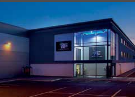
Headquarters of Accrol Papers

WEC Group Ltd, hand crafting the future one piece at a time