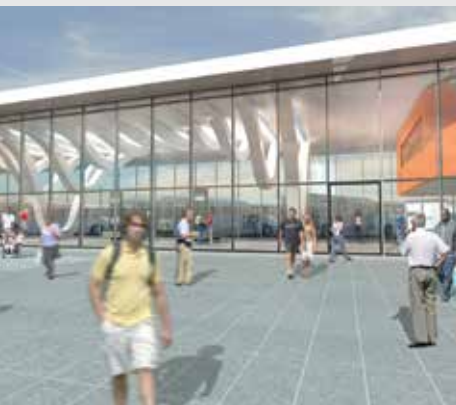
Blackburn bus station – completing early 2015

Luxury developments within the heart of the borough